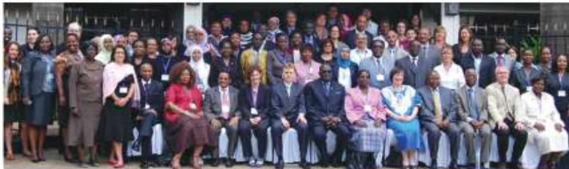
Attendees at the international conference on FGC in Nairobi, October 2011

Our advocacy work is based on making the case for investment in a movement that has momentum, is achieving results and is solution-focused. If strategic investments were made now, they could ultimately lead to the total abandonment of FGC.